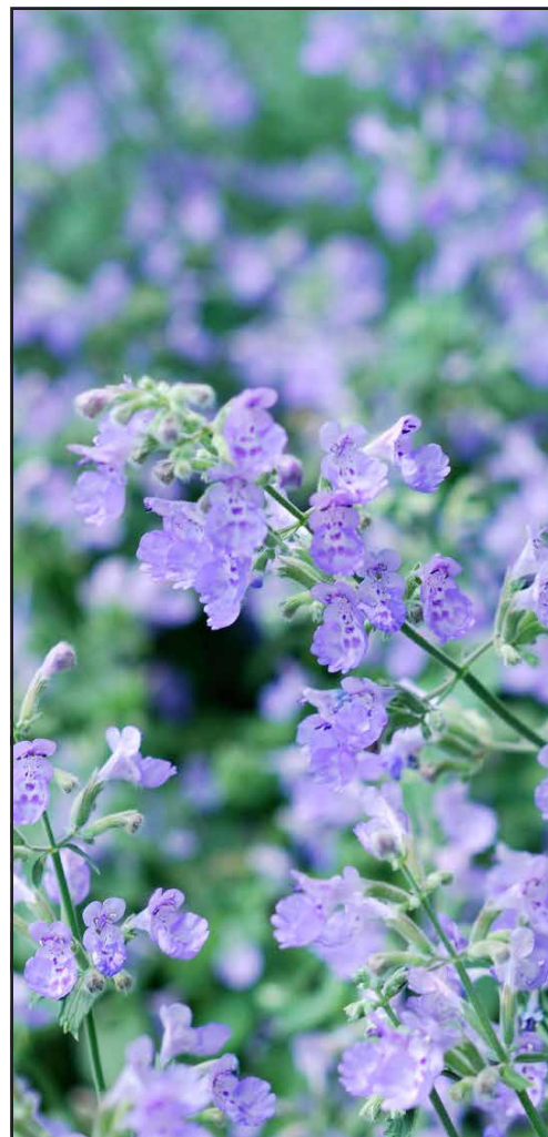
Nepeta 'Walker's Low' (Catmint)