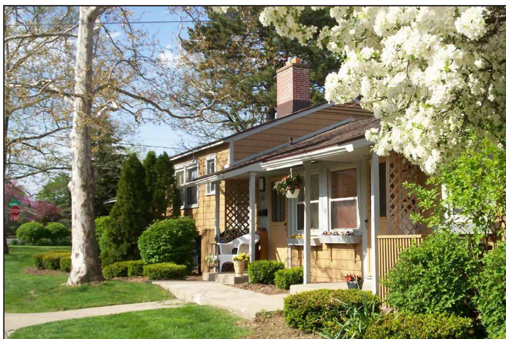
Spring is beautiful in Pittsfield Village!