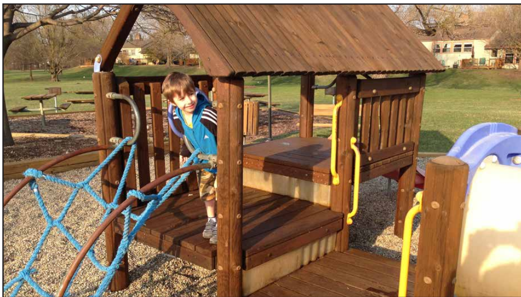
A boy from Pittsfield Boulevard checks out the refreshed play structure on the south end of Pittsfield Village.

In keeping with fiscal responsibility of Pittsfield Village funds, a survey regarding playground usage was taken last year. Most of the respondents felt that the play structures did enhance their enjoyment of living in Pittsfield Village. There were some respondents that felt that the structures were not of value. Rejuvenating the play structures was a modest investment in our property that struck a balance between those who enjoy the structures and those who have no use for them.